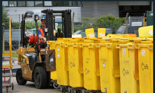
Clinical Waste Services