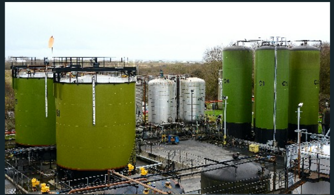
Treatment, Incineration & Recovery